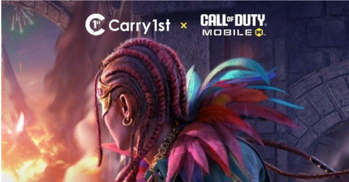
Call of Duty: Mobile season 10 also dropped this week.

Africa's Call of Duty: Mobile (CODM) players can now purchase Call of Duty Points (COD Points) and Battle Passes on the Carry1st Shop via Pay1st, Carry1st's payment platform. COD Points, the official in-game currency of CODM, enable players to acquire in-app items and weapons. Battle Pass is the in-game rewards system that allows players to progress through tiers and earn unique rewards such as weapon camos, outfits, and weapon blueprints.